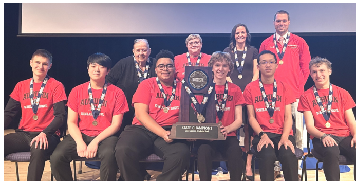
Auburn's team, coaches, principal, and athletic director after winning the IHSA Class AA State Championship Tournament