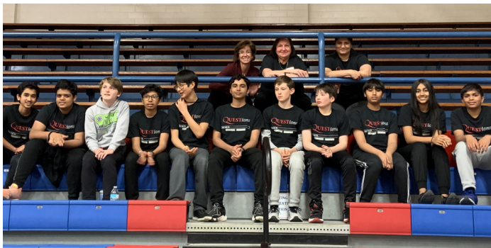
Quest after their IESA Sectional victory

We started strong in our 2022 year, having two of our teams place second and third at the SMV (Saint Mary's Visitation) Fall Tournament. For many of our players, this was their first tournament and it greatly strengthened our team's camaraderie. We then went on to the Auburn Knights Annual Tournament winning 2nd place overall in the Middle School Division. We learned a lot from this tournament, especially for our newer players. Our 5th and 6th Graders competed in the Keith Country Day Tournament and won 1st and 2nd place with a whopping 416 pts per game for our A team. For one of our final NAQT