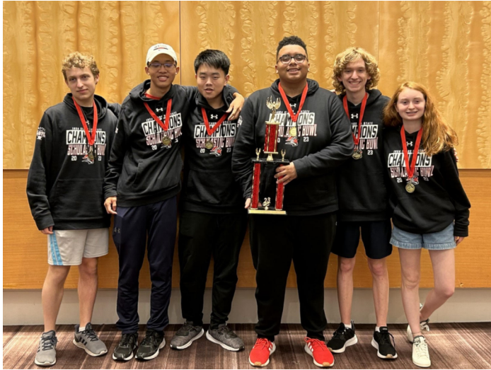
Auburn's team in their State Championship sweatshirts with their 13th place trophy at the High School National Championship Tournament