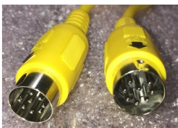
New, Reliable TABLESS Connectors!