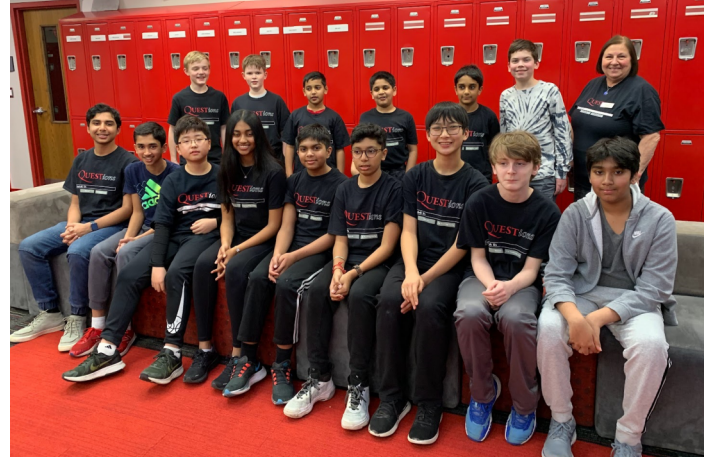
2022-23 Quest team photo