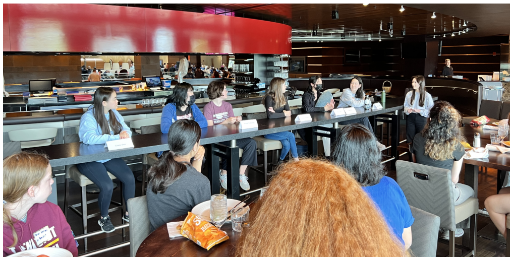
Left: Panelists speak during the AGQB luncheon at MSNCT 2023