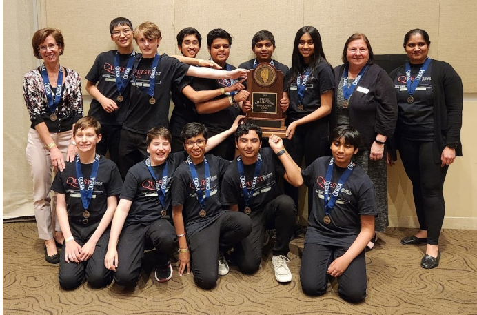
Palatine Quest's team and coaches after winning the IESA Class A State Championship Tournament

Some of our state's top middle school players and coaches tell us about their path to victory at the 2022-23 IESA State Championship Tournament.