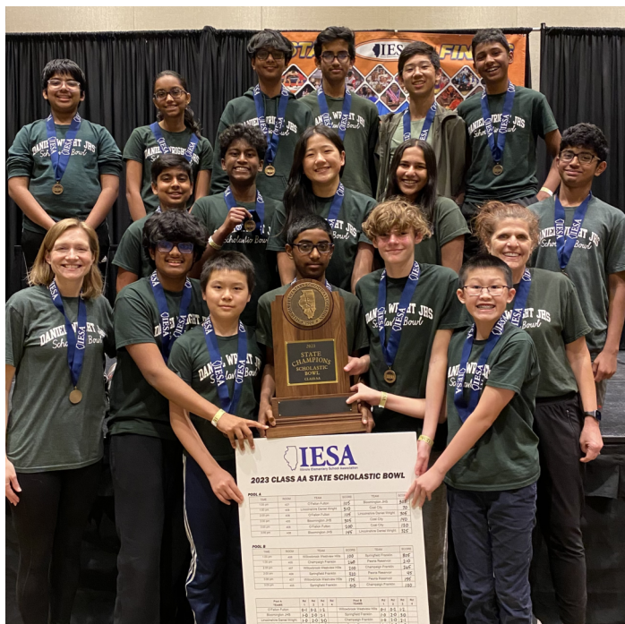
Lincolnshire Wright after winning the IHSA Class AA State Championship Tournament